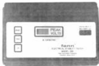
Fig.1 Model 23D Electrical Stability Tester