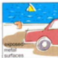
exposed metal surfaces