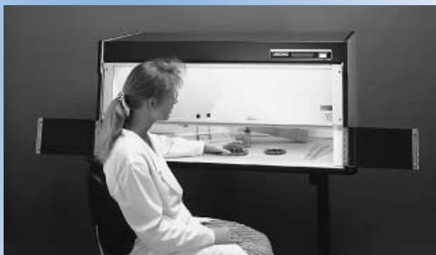
Protector ® Fiberglass Tissue Culture Enclosures