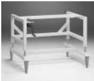
3780401 Manual Hydraulic Lift Adjustable Height Base Stand