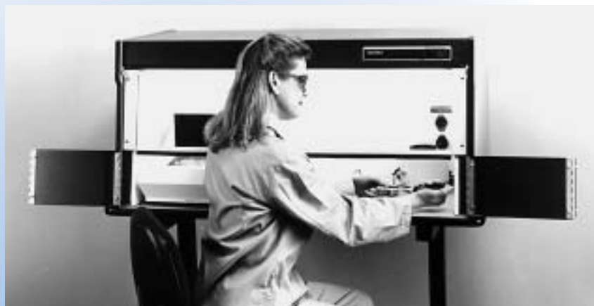
Protector ® Fiberglass PCR Enclosures