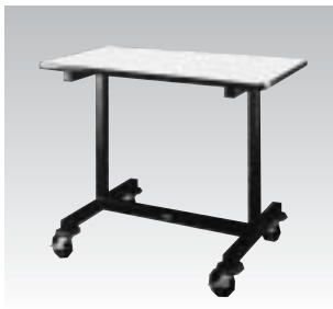
8060000 Mobile Bench