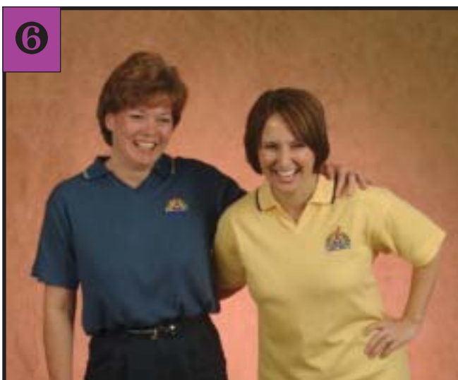
6 LADIES' POLO SHIRT, 30 BUCKS 7.5 ounce, 60% cotton/40% polyester blend. Color-tipped collar, v-neck, square bottom with side vents. Subtle needle-stitch vertical stripe. Sizes: S-XXL. Colors: White/Navy, Sunflower/Navy, Black/Khaki, and Mountain Blue/Khaki.