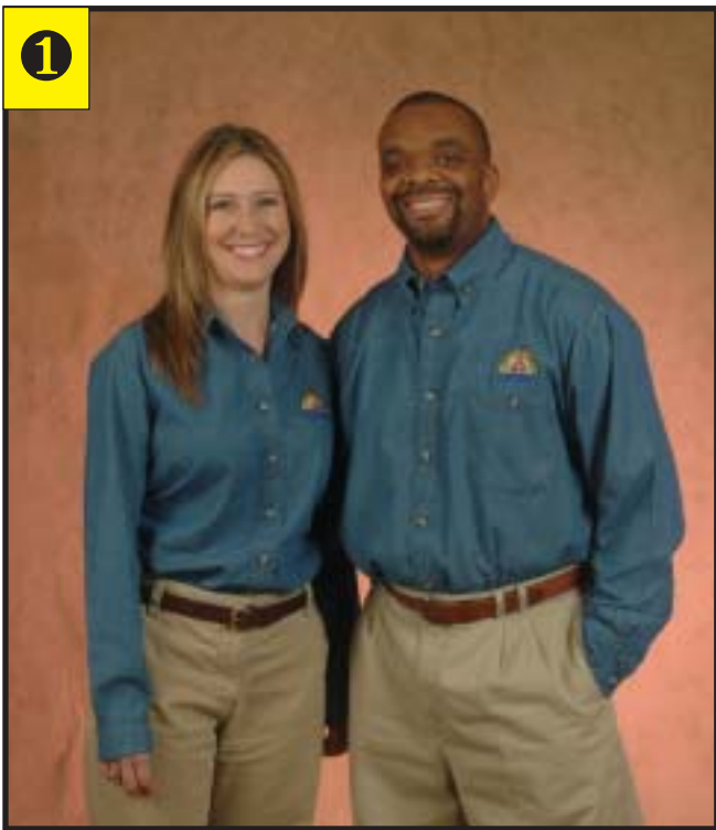
1 BLUE DENIM SHIRT, 30 BUCKS 100% cotton; long sleeves. Men's style has button-down collar. Ladies' style has spread collar. Both have adjustable cuffs and are enzyme washed for a soft feel. Men's sizes: M-XXL. Ladies' sizes: S-XXL. Labby embroidered on left.