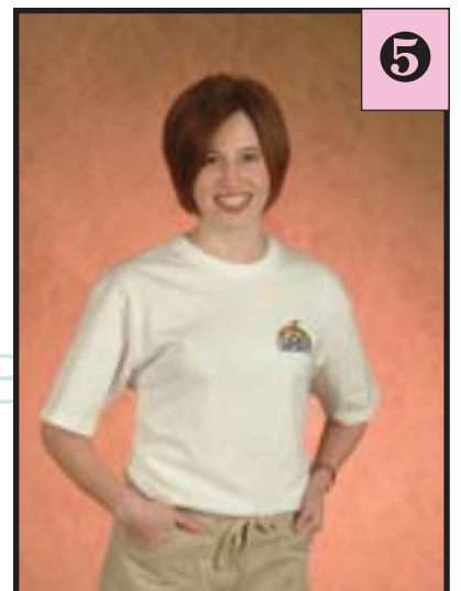
5 SHORT SLEEVE T-SHIRT, 12 BUCKS Heavy 7 ounce, 100% cotton. Sizes: S-XXL. Color: White. Labby embroidered on left side.