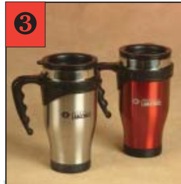
Dishwasher safe; super insulated for hot or cold beverages. Colors: Silver or Red. Labconco logo printed on both sides.