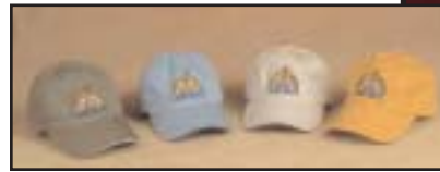
2 SANDWICH VISOR CAP, 12 BUCKS Bio-washed twill, unstructured, six panel, low profile. Colors: Yellow/Navy; Carolina Blue/Navy; Khaki/Navy; Stone/Black. Labby embroidered in center.