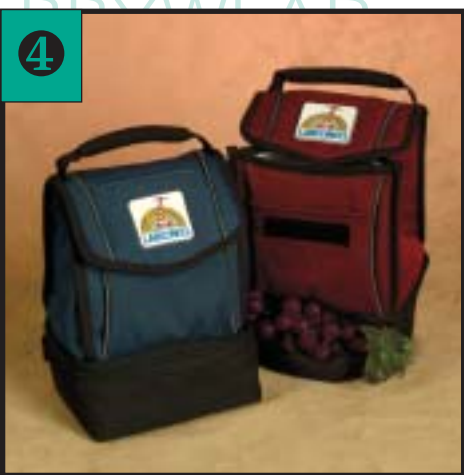
4 LUNCH BAG, 15 BUCKS Two separate, roomy, insulated areas for food and drink; front pocket with hook and loop closure for small items located above the logo. Colors: Blue or Red. Labby logo in center.