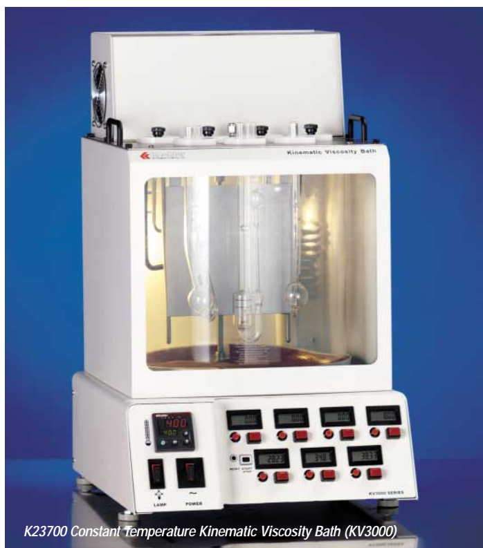
K23700 Constant Temperature Kinematic Viscosity Bath (KV3000)

Included Accessories Port covers, Delrin® (7) Thermometer holder