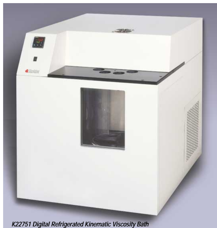
K22751 Digital Refrigerated Kinematic Viscosity Bath

Microprocessor controller incorporates circuitry that interrupts power to the heater in the event of an overtemperature condition or disconnection of the primary probe. A redundant adjustable controller and sensor probe provide added overtemperature protection, and an integrated low liquid level sensor cuts power to the heaters if the bath liquid is not filled to the proper level or falls below during operation. Both overtemperature and low liquid level circuits will latch and prevent further operation of the bath until the fault is removed.