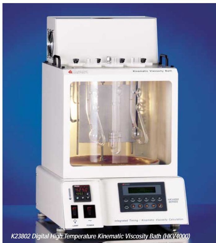
K23802 Digital High Temperature Kinematic Viscosity Bath (HKV4000)

Bath Construction and Safety Features - Bath chamber is a clear Pyrex® vessel enclosed in an insulated polyester-epoxy finished steel housing. Top working surface has seven 2" (51mm) viscometer ports. Front viewing window assures safe, distortion-free viewing. Microprocessor temperature controller incorporates safety circuitry that interrupts power to the heaters in the event of an overtemperature condition or disconnection of the primary probe. For added safety, an adjustable redundant controller with separate sensor probe interrupts power if an overtemperature situation occurs. An integrated low-liquid sensor prevents operation of the bath if the bath liquid is not filled to the proper level and cuts off power should it fall below during operation. Both overtemperature and low liquid level circuits will latch and prevent further operation of the bath until the fault is removed.