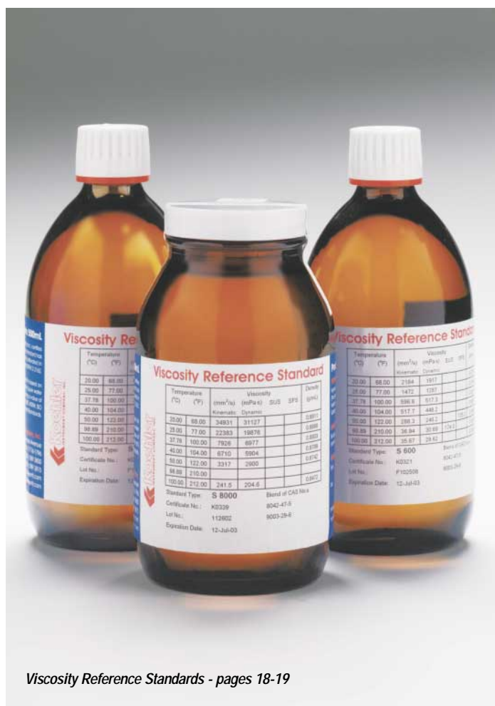
Viscosity Reference Standards - pages 18-19