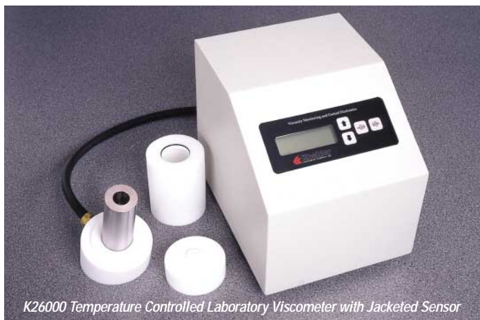
K26000 Temperature Controlled Laboratory Viscometer with Jacketed Sensor