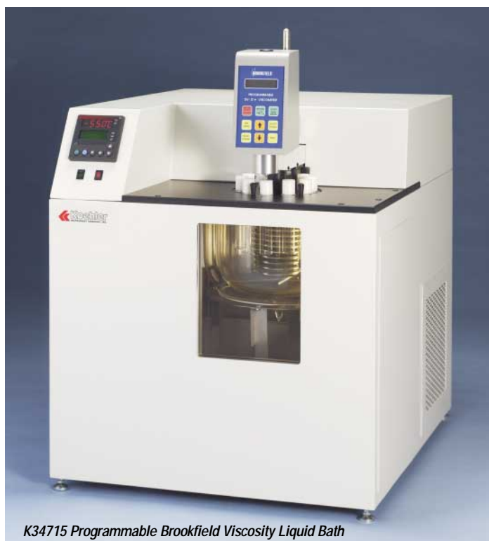
K34715 Programmable Brookfield Viscosity Liquid Bath