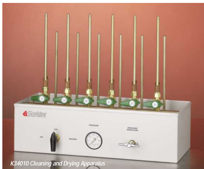
K34010 Cleaning and Drying Apparatus