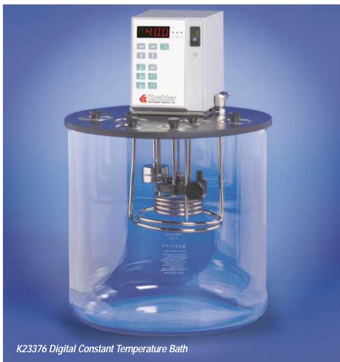
K23376 Digital Constant Temperature Bath