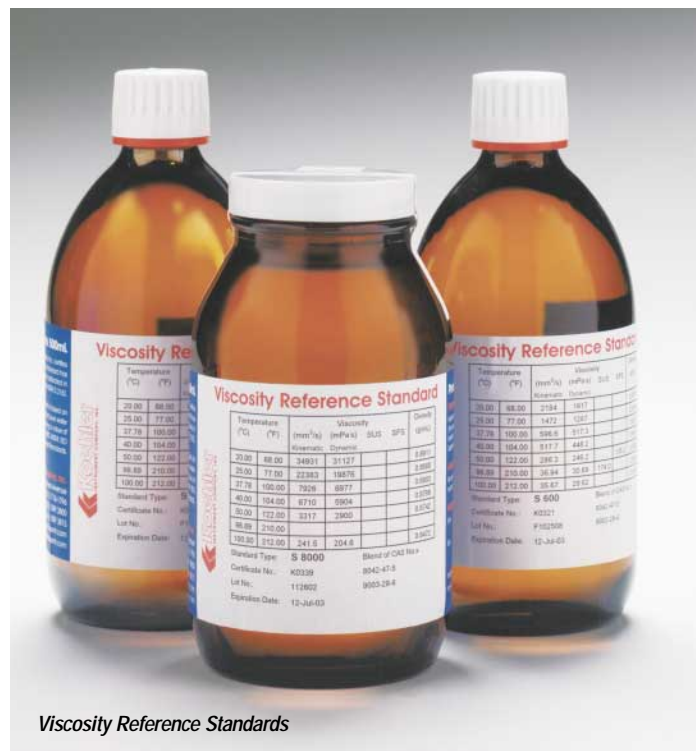
Viscosity Reference Standards

In addition to the many viscosity standards described in this catalog, we can supply custom viscosity standards made specifically to meet your individual needs including high volume supply used for Statistical Quality Check and Statistical Process Control (SQC/SPC) applications.