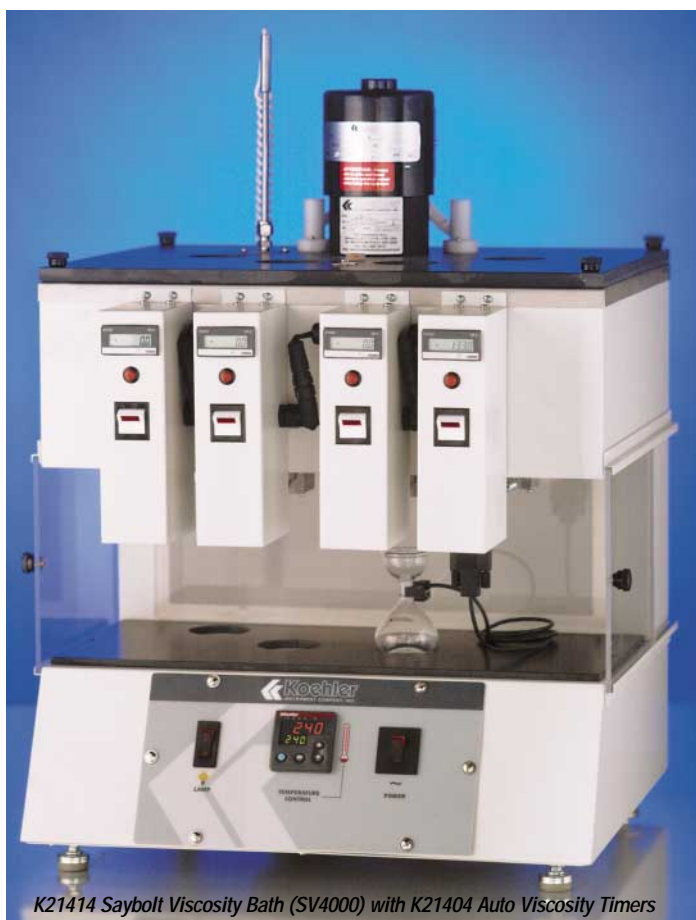
K21414 Saybolt Viscosity Bath (SV4000) with K21404 Auto Viscosity Timers