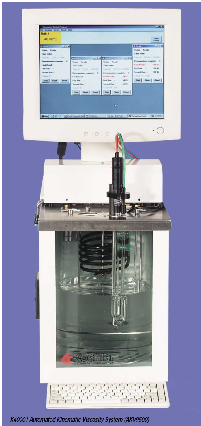
K40001 Automated Kinematic Viscosity System (AKV9500)

*Please specify viscometer type when ordering.