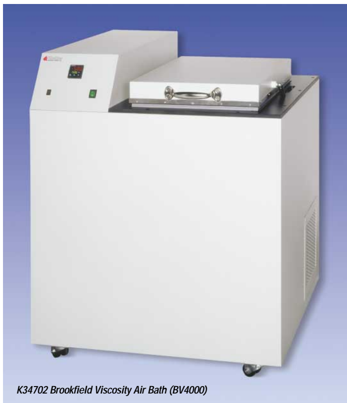
K34702 Brookfield Viscosity Air Bath (BV4000)